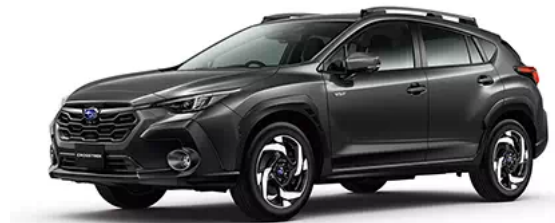
Subaru Crosstrek equipped with next-generation hybrid system (Japan model, prototype)

This newly developed hybrid system is designed to achieve a superior balance between driving enjoyment and environmental performance.