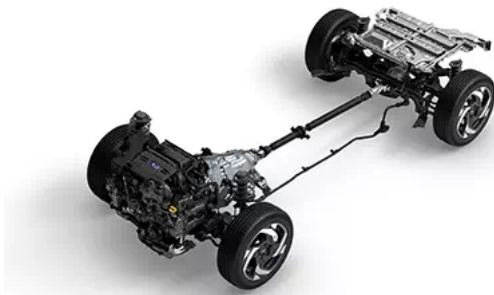
Subaru Next-Generation Hybrid System

Tokyo, October 17, 2024 – Subaru Corporation announces the debut of the next-generation hybrid system. The next-generation hybrid system will first be equipped to the Subaru Crosstrek (Japan model), scheduled for release in December 2024.